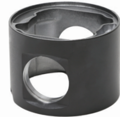
HP Piston Skirt Dry Film Lubricant Coating

Dry-Film Lubrication Coating provides solid lubrication resulting in higher load capacity and friction reduction, also protects the piston rings by preventing micro-welding and abrasive wear.